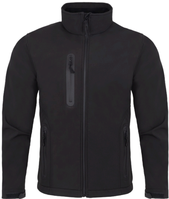
Front of jacket SLRA 8000 – black