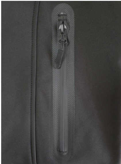
Taped pocket zippers